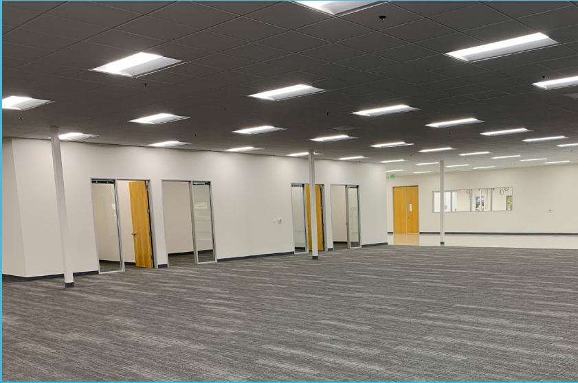
MOVE IN READY