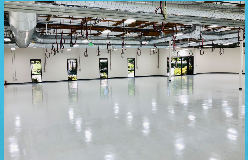
COMBINATION OFFICE, LABS, WAREHOUSE