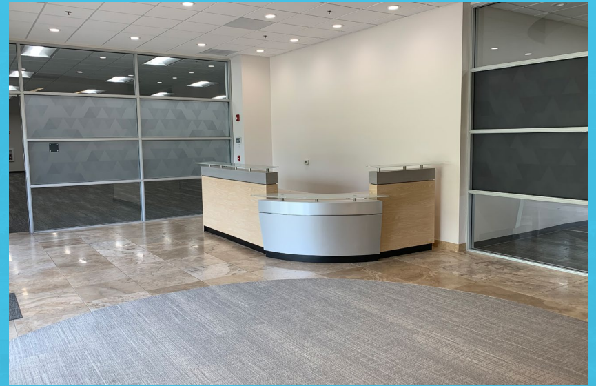
NEWLY COMPLETED MARKET READY IMPROVEMENTS